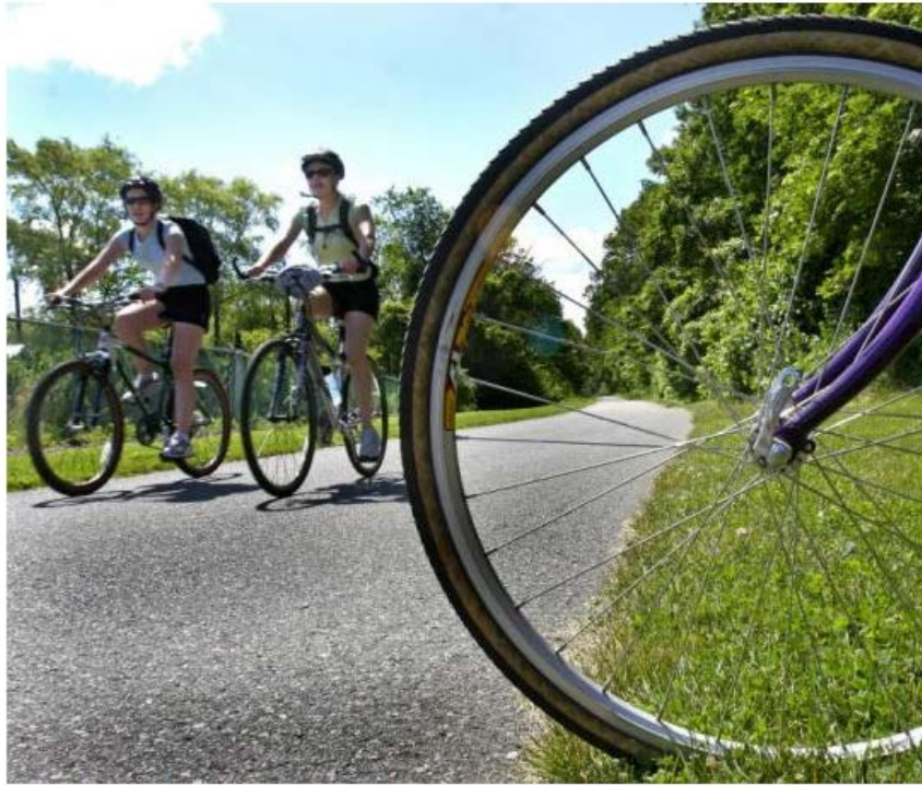
Riders on the Minuteman bike path along the Arlington-Lexington line. Such projects typically take about 10 years to finish because of the state's convoluted application process.

State ranks last, tapping 37% of grants since 1991